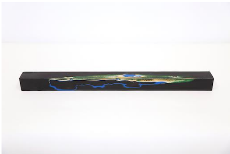
untitled Square timber, Lacquer, and Shells / 48.0×3.6×3.6 cm / 2016

Warehouse TERRADA is dedicating to change its base, Tennoz Isle to a source of art and culture, and launched TERRADA Art Complex on September 10th, which has gallery rooms and art studios for artists. Warehouse TERRADA is and will be supporting up-and-coming young artists both from Japan and foreign countries in various ways, taking over Japanese traditional and fascinating techniques that have built up Japanese art and culture, and passing them to the next generation and the world.