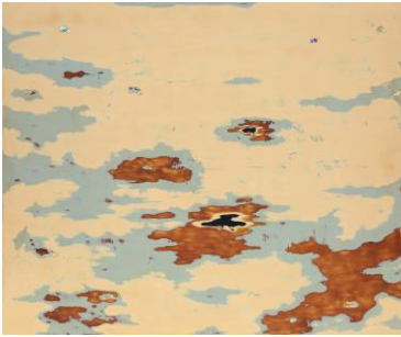
untitled Wooden panel, Lacquer, and Shells / 75.2×90.0 cm / 2015

I feel an existence like a single line created over time. There are various types of lines, such as lines that connect an artwork with a person and lines that connect a person with another person, but the lines in my work are lines that connect the past with the present and lines that connect people with memories. When you apply layer upon layer of urushi and carefully scrape away the surface, the layers of urushi emerge in patterns. The patterns that emerge represent layers of memory, or a visualization of lines that cannot be seen. Revealing lines that exist but cannot be seen, such as those connecting the past and present and those connecting people with memories, unveils scenes that could not be seen before. I am creating works to see such scenes that haven't been seen before.